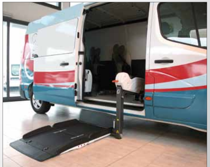
Fiorella Slim Fit F360EX

Opel Movano for the transportation of people in wheelchair can be equipped with Fiorella Slim Fit F360 (the Standard version with a platform size of 1030x714 mm) and F360EX (the Extended version with wider platform of 1075x765 mm, suitable for bulky electric wheelchairs or scooters). Fiorella Slim Fit, in both the versions, can be installed even on the side door of Opel Movano.