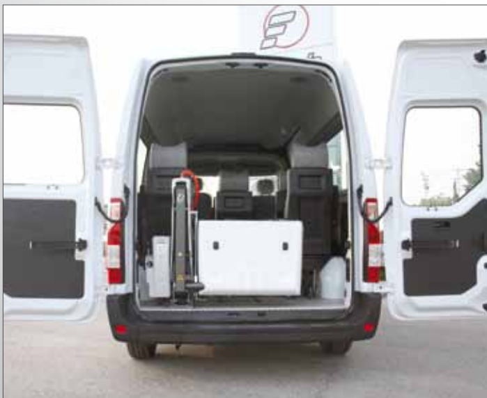
Fiorella Slim Fit F360